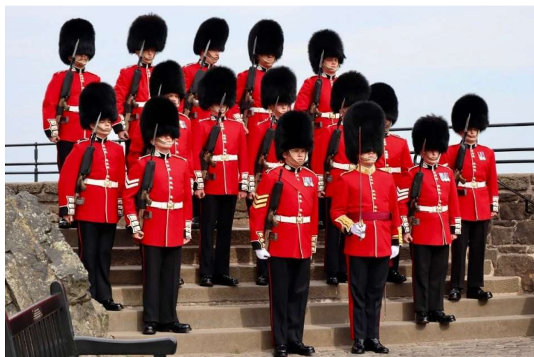
Guards outside St Margaret's Chapel in celebration of the King's Birthday Salute.