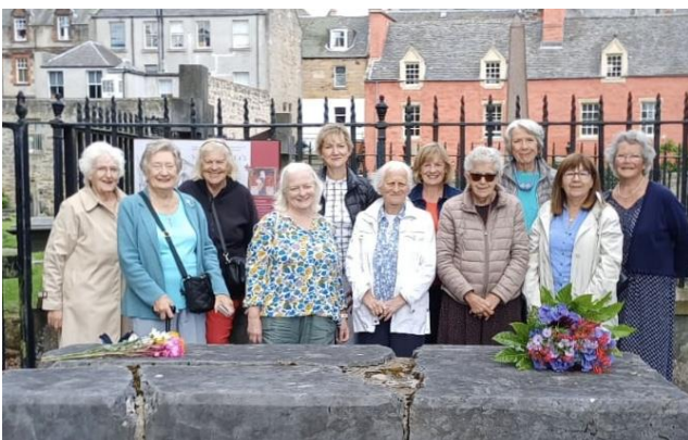
Pilgrims on the road