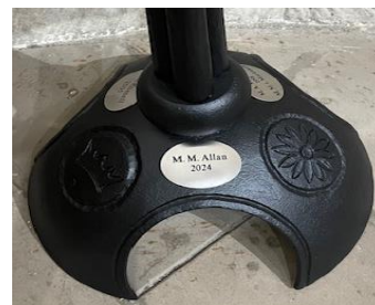
Commemorative name plates