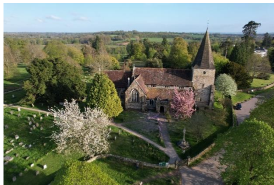
Parish Church of St Margaret the Queen, Buxted

Tradition holds that the church was consecrated in 1250, the year in which Queen Margaret was canonised. This made 2025 a particularly significant year for Buxted.