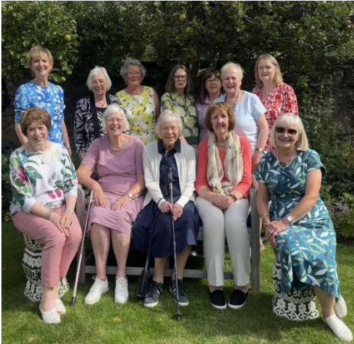
Money collectors sharing memories

"The first time I collected money I went home to my husband and he asked me how I got on and said, 'How much did you collect, about £200?' and I said '£1400!'"