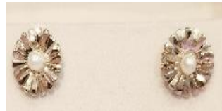
Earrings £54 per pair

Articles for our next Newsletter We're always interested to hear from members with ideas for articles for our newsletter. Please email catrinamarg@aol.com Members password for website: 10daisy93