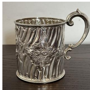
Child's silver mug left in the chapel anonymously and given to the Guild by the Ministry of Works in 1950