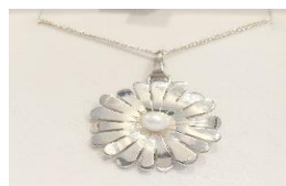
Pendant and chain £60

Current prices: Postage & Packing will be added to any items requiring shipping