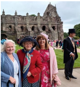
3 members of the Guild in their Palace outfits