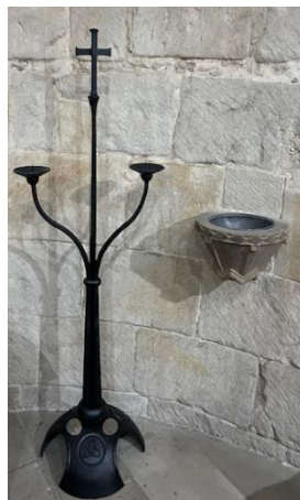
Chapel candlestick used during ceremonies