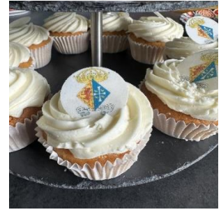
Cakes fit for a queen